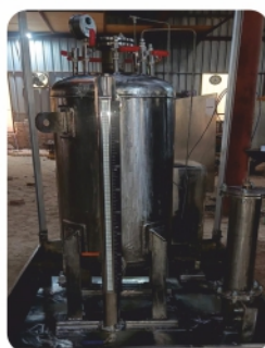
NG/CBG Odorizing Unit