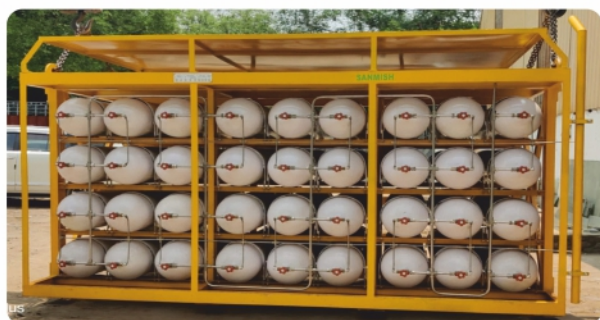
CNG/CBG/Hydrogen Cascade (150 WL to 10500 WL)