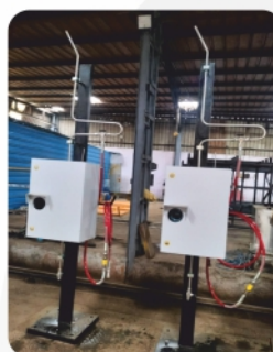
LCV Fill Post with Mass Flow Meter