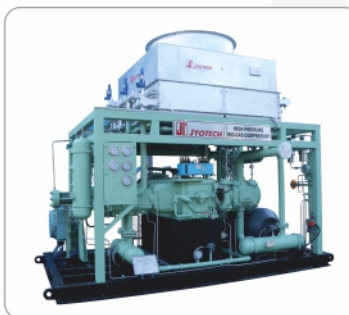
High Pressure Compressor & Boosters (250 SCMH to 2400 SCMH)