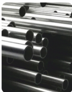
SS Tubes (Authorised distributor for Jindal Tubes)