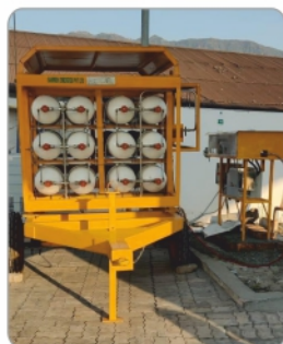
Innovative cascades with PRS for all Applications