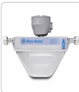
Mass Flow Meter (PESO & W&M approved)