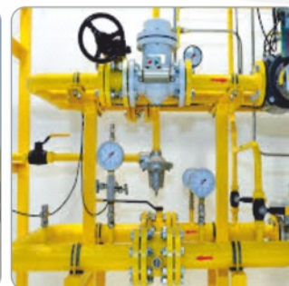
PNG Metering & Regulating Stations | Decompression Unit