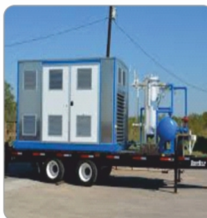
CNG Mobile Refueling Unit